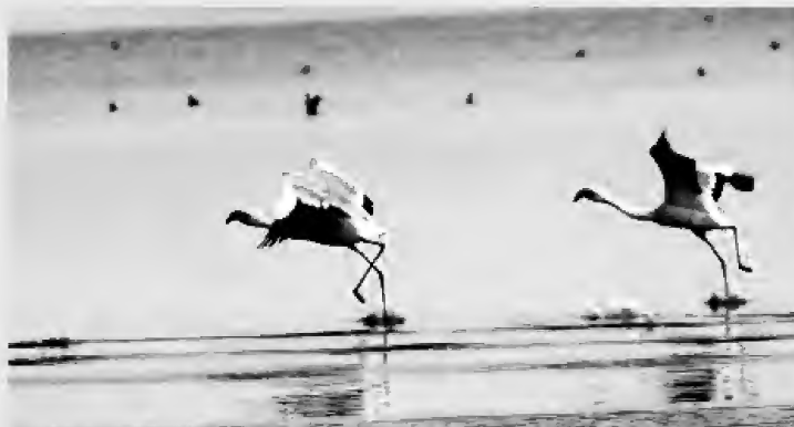
Lesser Flamingos of Gujarat